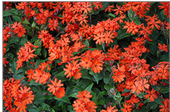
Vesuvius Campion flowers