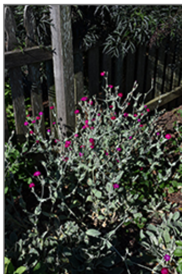
Rose Campion in bloom