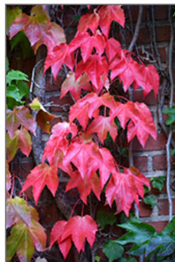
Boston Ivy in fall