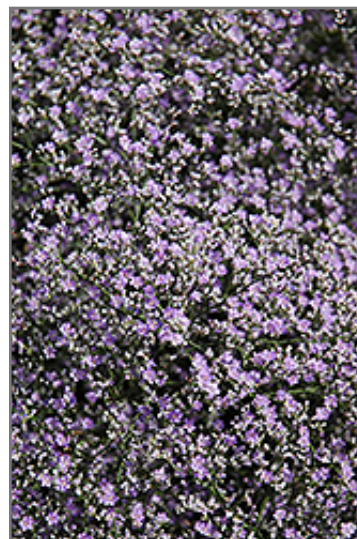
Sea Lavender flowers