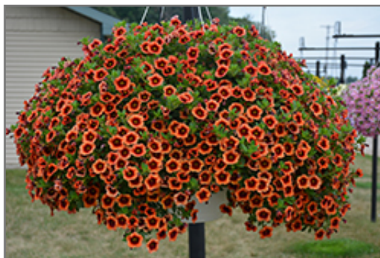
Superbells Tangerine Punch Calibrachoa in bloom