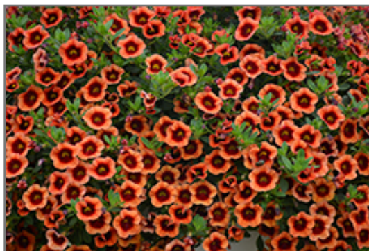
Superbells Tangerine Punch Calibrachoa flowers

Superbells Tangerine Punch Calibrachoa is a dense herbaceous annual with a trailing habit of growth, eventually spilling over the edges of hanging baskets and containers. Its medium texture blends into the garden, but can always be balanced by a couple of finer or coarser plants for an effective composition.