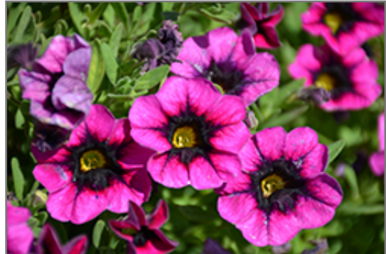
Superbells Blackcurrent Punch Calibrachoa flowers