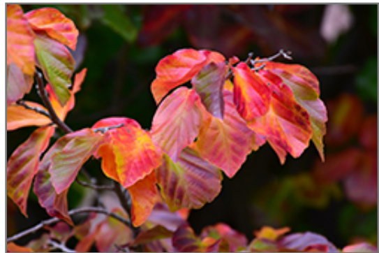
Persian Parrotia in fall