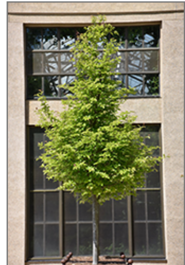
Persian Parrotia