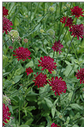
Crimson Scabious flowers