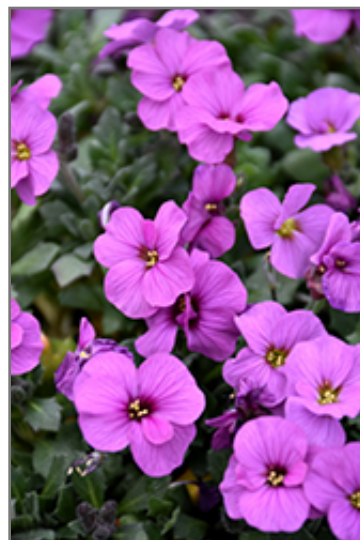
Axcent Antique Rose Rock Cress flowers