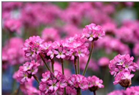
Vesuvius Black-leaved Sea Thrift flowers

This is a relatively low maintenance plant, and should be cut back in late fall in preparation for winter. Deer don't particularly care for this plant and will usually leave it alone in favor of tastier treats. It has no significant negative characteristics.