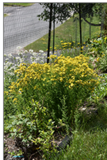
St. John's Wort in bloom