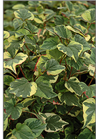
Variegated Chameleon Plant foliage