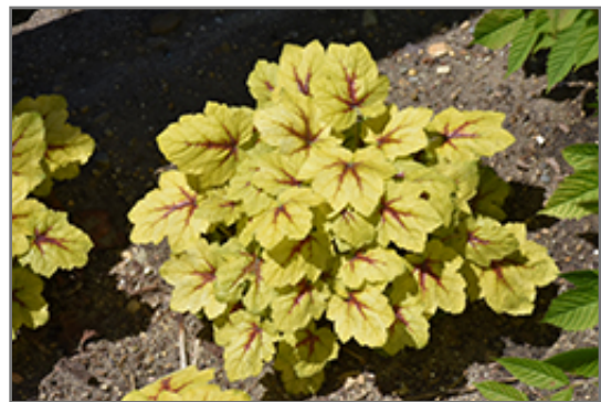
Catching Fire Foamy Bells