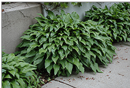
Invincible Hosta