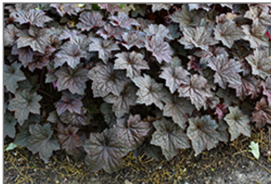
Palace Purple Coral Bells

Palace Purple Coral Bells is a fine choice for the garden, but it is also a good selection for planting in outdoor pots and containers. With its upright habit of growth, it is best suited for use as a 'thriller' in the 'spiller-thriller-filler' container combination; plant it near the center of the pot, surrounded by smaller plants and those that spill over the edges. Note that when growing plants in outdoor containers and baskets, they may require more frequent waterings than they would in the yard or garden.