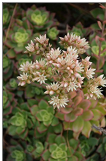
Kiwi Aeonium flowers