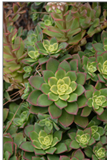
Kiwi Aeonium foliage

Kiwi Aeonium is a fine choice for the garden, but it is also a good selection for planting in outdoor pots and containers. Because of its spreading habit of growth, it is ideally suited for use as a 'spiller' in the 'spiller-thriller-filler' container combination; plant it near the edges where it can spill gracefully over the pot. Note that when growing plants in outdoor containers and baskets, they may require more frequent waterings than they would in the yard or garden.