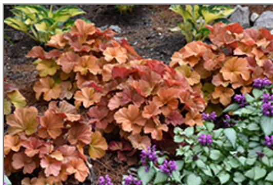
Northern Exposure Amber Coral Bells