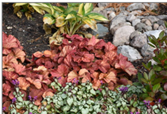
Northern Exposure Amber Coral Bells

Northern Exposure Amber Coral Bells is a fine choice for the garden, but it is also a good selection for planting in outdoor pots and containers. It is often used as a 'filler' in the 'spiller-thriller-filler' container combination, providing a mass of flowers and foliage against which the larger thriller plants stand out. Note that when growing plants in outdoor containers and baskets, they may require more frequent waterings than they would in the yard or garden.