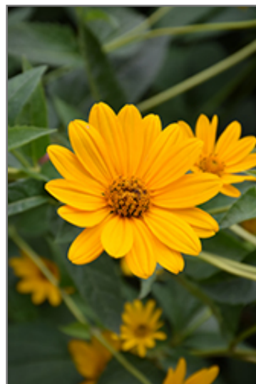
False Sunflower flowers

This is a relatively low maintenance plant, and is best cleaned up in early spring before it resumes active growth for the season. It is a good choice for attracting butterflies to your yard. It has no significant negative characteristics.