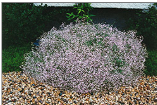
Pink Fairy Baby's Breath in bloom