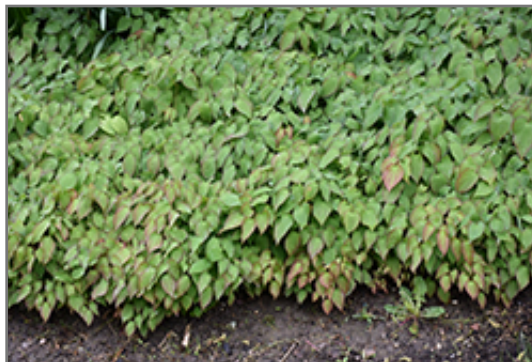
Bishop's Hat