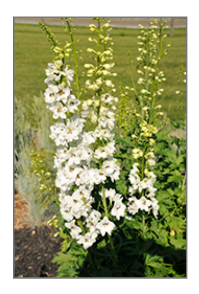
Pacific Giant Galahad Larkspur flowers