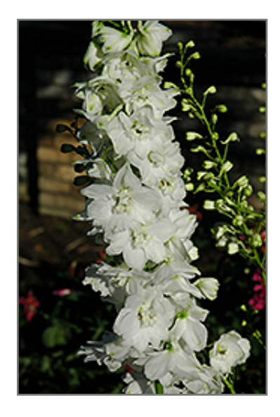
Pacific Giant Galahad Larkspur flowers