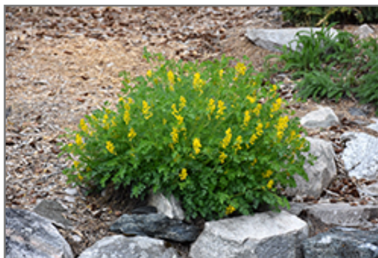
Golden Corydalis in bloom

Golden Corydalis will grow to be about 12 inches tall at maturity, with a spread of 12 inches. Its foliage tends to remain dense right to the ground, not requiring facer plants in front. It grows at a medium rate, and under ideal conditions can be expected to live for approximately 5 years. As an herbaceous perennial, this plant will usually die back to the crown each winter, and will regrow from the base each spring. Be careful not to disturb the crown in late winter when it may not be readily seen!