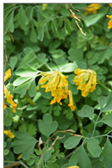
Golden Corydalis flowers