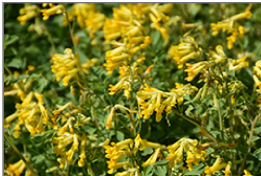
Golden Corydalis flowers