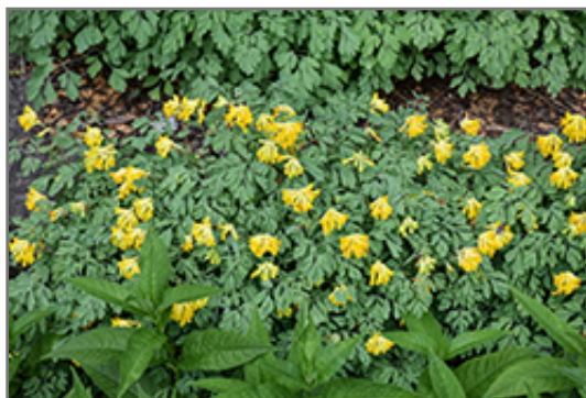
Golden Corydalis in bloom