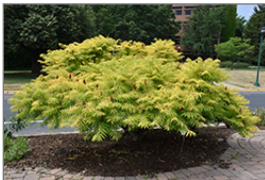
Tiger Eyes Sumac