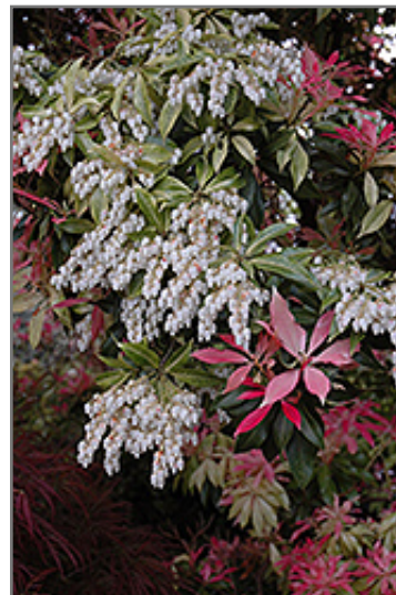
Valley Fire Japanese Pieris flowers

Valley Fire Japanese Pieris is recommended for the following landscape applications;