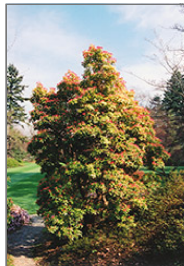
Valley Fire Japanese Pieris

This shrub does best in full sun to partial shade. It requires an evenly moist well-drained soil for optimal growth, but will die in standing water. It is very fussy about its soil conditions and must have rich, acidic soils to ensure success, and is subject to chlorosis (yellowing) of the foliage in alkaline soils. It is somewhat tolerant of urban pollution, and will benefit from being planted in a relatively sheltered location. Consider applying a thick mulch around the root zone in winter to protect it in exposed locations or colder microclimates. This is a selected variety of a species not originally from North America, and parts of it are known to be toxic to humans and animals, so care should be exercised in planting it around children and pets.