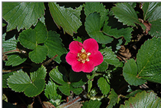
Tristan Strawberry flowers

Tristan Strawberry features showy hot pink cup-shaped flowers with gold eyes along the stems from mid spring to late summer. Its serrated round compound leaves remain dark green in colour throughout the season. It features an abundance of magnificent red berries from late spring to early fall.