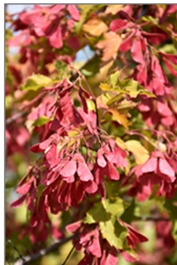
Amur Maple (tree form) fruit

This tree does best in full sun to partial shade. It is very adaptable to both dry and moist locations, and should do just fine under average home landscape conditions. It is not particular as to soil type or pH. It is highly tolerant of urban pollution and will even thrive in inner city environments. This is a selected variety of a species not originally from North America.