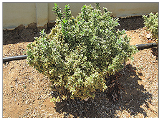
Variegated Boxleaf Japanese Euonymus