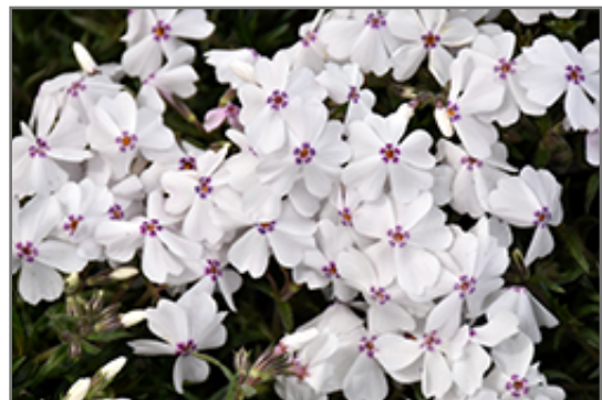
Amazing Grace Moss Phlox flowers