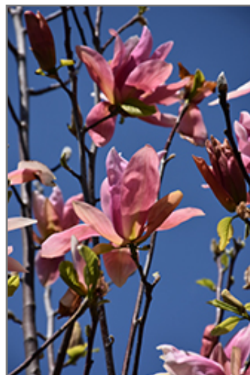
Daybreak Magnolia flowers