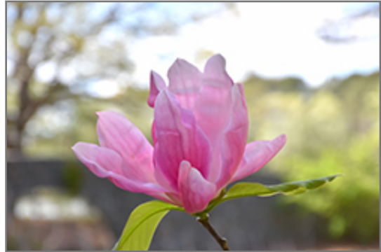
Daybreak Magnolia flowers

This tree does best in full sun to partial shade. It requires an evenly moist well-drained soil for optimal growth, but will die in standing water. It is not particular as to soil type, but has a definite preference for acidic soils. It is quite intolerant of urban pollution, therefore inner city or urban streetside plantings are best avoided. Consider applying a thick mulch around the root zone in winter to protect it in exposed locations or colder microclimates. This particular variety is an interspecific hybrid.