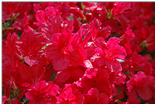
Hino Red Azalea flowers