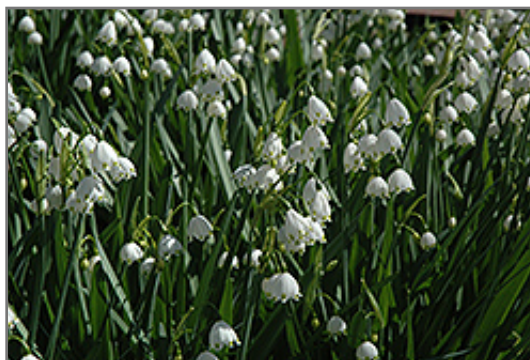
Gravetye Giant Summer Snowflake flowers

This is a relatively low maintenance plant, and should be cut back in late fall in preparation for winter. It is a good choice for attracting bees and butterflies to your yard. It has no significant negative characteristics.