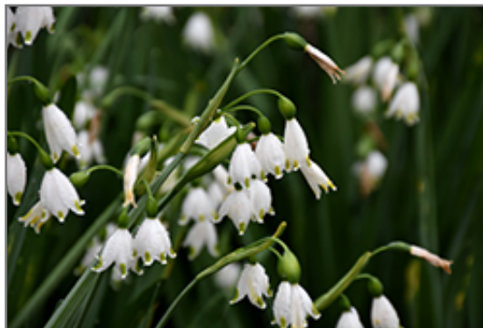
Gravetye Giant Summer Snowflake flowers

Gravetye Giant Summer Snowflake is a fine choice for the garden, but it is also a good selection for planting in outdoor pots and containers. It can be used either as 'filler' or as a 'thriller' in the 'spiller-thriller-filler' container combination, depending on the height and form of the other plants used in the container planting. Note that when growing plants in outdoor containers and baskets, they may require more frequent waterings than they would in the yard or garden.