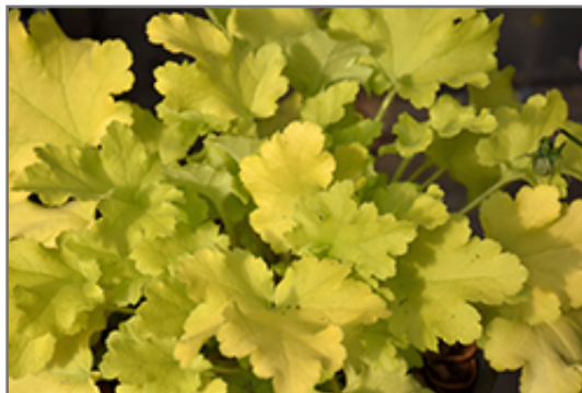
Lime Marmalade Coral Bells foliage

Lime Marmalade Coral Bells is a fine choice for the garden, but it is also a good selection for planting in outdoor pots and containers. With its upright habit of growth, it is best suited for use as a 'thriller' in the 'spiller-thriller-filler' container combination; plant it near the center of the pot, surrounded by smaller plants and those that spill over the edges. Note that when growing plants in outdoor containers and baskets, they may require more frequent waterings than they would in the yard or garden.