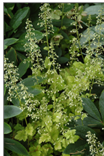
Lime Marmalade Coral Bells flowers