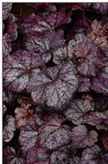
Grape Expectations Coral Bells foliage