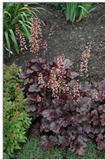
Grape Expectations Coral Bells in bloom

This is a relatively low maintenance plant, and should be cut back in late fall in preparation for winter. It is a good choice for attracting hummingbirds to your yard. It has no significant negative characteristics.