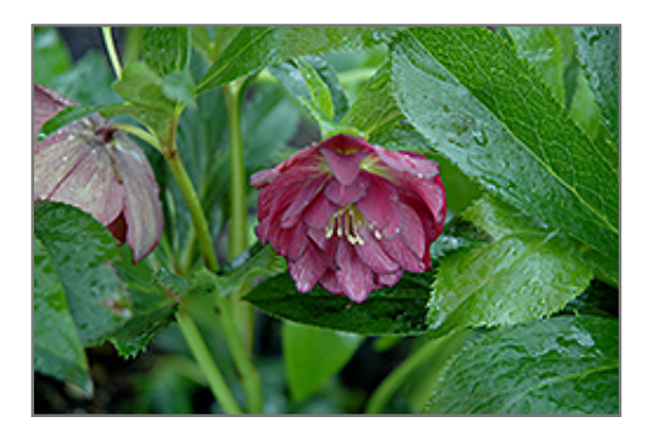
Midnight Ruffles Hellebore flowers

Midnight Ruffles Hellebore is recommended for the following landscape applications;