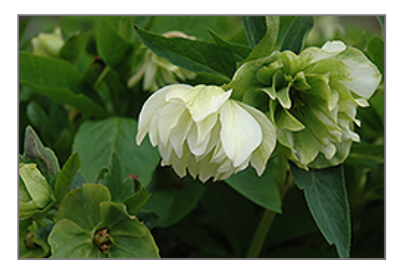
Double Integrity Hellebore flowers