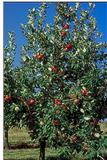
Zestar Apple fruit

This tree is typically grown in a designated area of the yard because of its mature size and spread. It should only be grown in full sunlight. It prefers to grow in average to moist conditions, and shouldn't be allowed to dry out. It is not particular as to soil type or pH. It is highly tolerant of urban pollution and will even thrive in inner city environments. This particular variety is an interspecific hybrid.