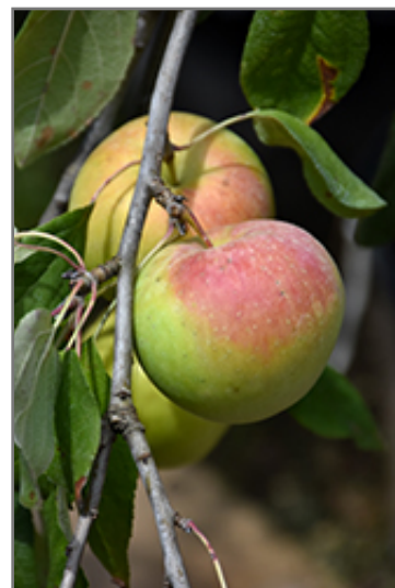
Zestar Apple fruit