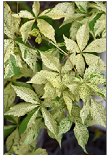
Star Showers Virginia Creeper foliage