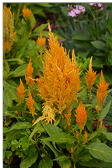
Fresh Look Yellow Celosia flowers