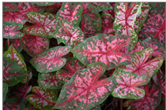
Carolyn Whorton Caladium foliage