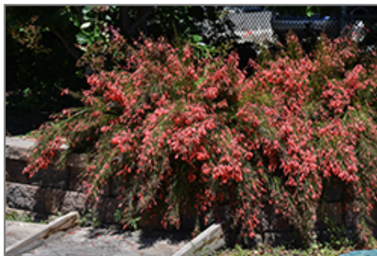
Firecracker Plant in bloom