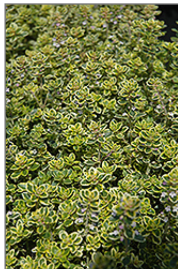
Lemon Thyme foliage

Lemon Thyme is smothered in stunning spikes of lilac purple flowers rising above the foliage from early to late summer. Its attractive tiny fragrant round leaves remain light green in colour throughout the year.