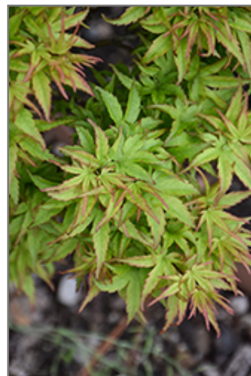
Sharp's Pygmy Japanese Maple foliage