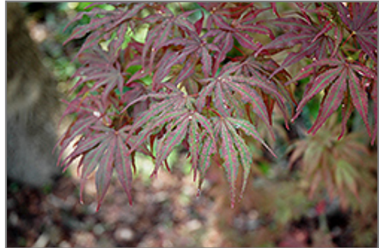
Mikazuki Japanese Maple foliage

Mikazuki Japanese Maple is recommended for the following landscape applications;