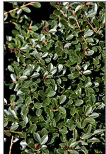
Helleri Japanese Holly foliage