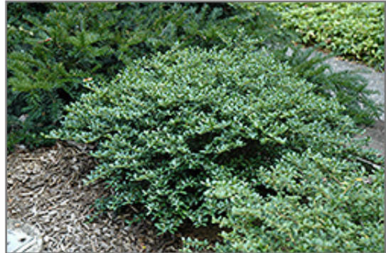
Helleri Japanese Holly