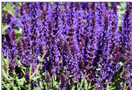
Lyrical Blues Meadow Sage flowers

Lyrical Blues Meadow Sage is recommended for the following landscape applications;