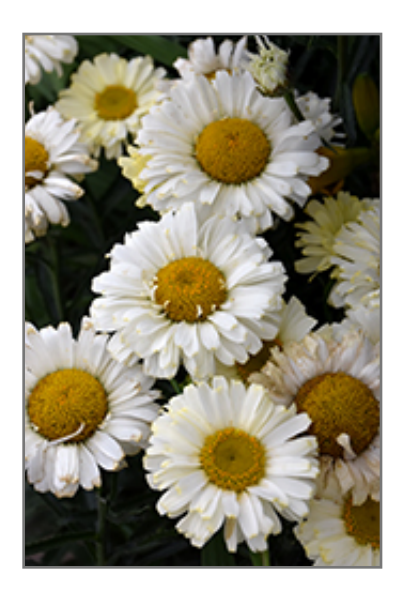
Realflor Real Dream Shasta Daisy flowers

Realflor Real Dream Shasta Daisy is an herbaceous perennial with an upright spreading habit of growth. Its medium texture blends into the garden, but can always be balanced by a couple of finer or coarser plants for an effective composition.