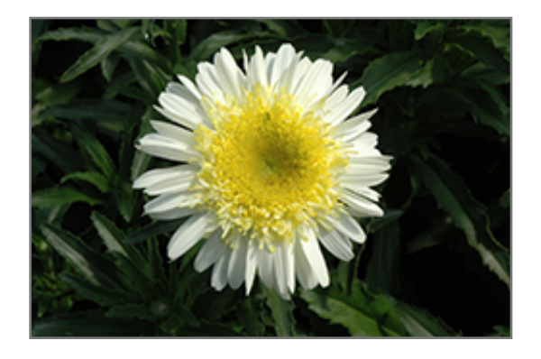
Realflor Real Dream Shasta Daisy flowers

This plant will require occasional maintenance and upkeep, and should be cut back in late fall in preparation for winter. It is a good choice for attracting butterflies to your yard. Gardeners should be aware of the following characteristic(s) that may warrant special consideration;