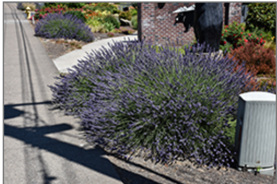
Phenomenal Lavender in bloom

Phenomenal Lavender is a dense multi-stemmed evergreen shrub with a mounded form. It lends an extremely fine and delicate texture to the landscape composition which should be used to full effect.