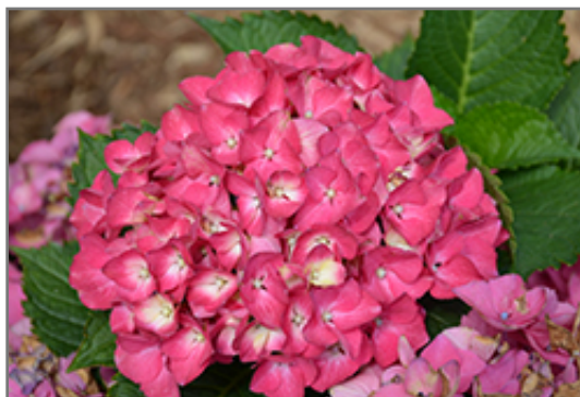
Cityline Paris Hydrangea flowers

Cityline Paris Hydrangea makes a fine choice for the outdoor landscape, but it is also well-suited for use in outdoor pots and containers. Because of its height, it is often used as a 'thriller' in the 'spiller-thriller-filler' container combination; plant it near the center of the pot, surrounded by smaller plants and those that spill over the edges. It is even sizeable enough that it can be grown alone in a suitable container. Note that when grown in a container, it may not perform exactly as indicated on the tag - this is to be expected. Also note that when growing plants in outdoor containers and baskets, they may require more frequent waterings than they would in the yard or garden.