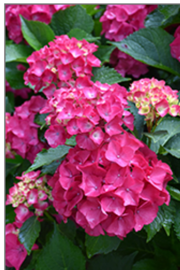
Cityline Paris Hydrangea flowers

Cityline Paris Hydrangea is recommended for the following landscape applications;