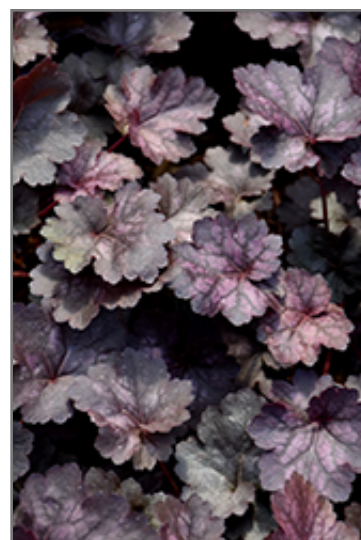
Glitter Coral Bells foliage