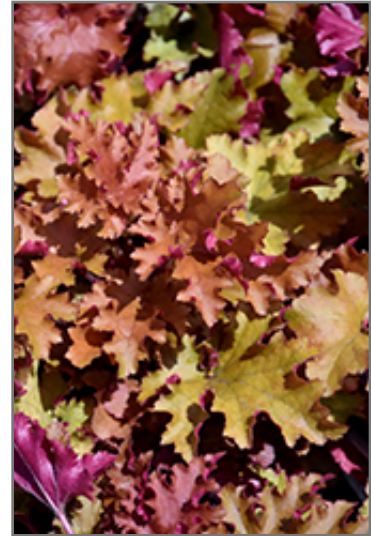
Zipper Coral Bells foliage

Zipper Coral Bells is recommended for the following landscape applications;